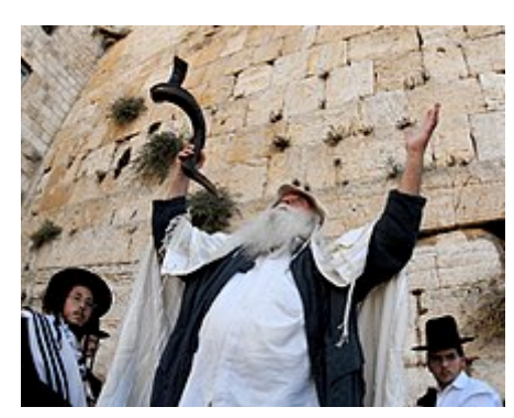
Jewish "Slichot" prayer service with shofar during the Days of Repentance preceding Yom Kippur at the Western Wall in Jerusalem's Old City, 2008.

According to <u>Jewish law</u> women and minors are exempt from the commandment of hearing the shofar blown (as is the case with any positive, time-bound commandment), but they are encouraged to attend the ceremony.