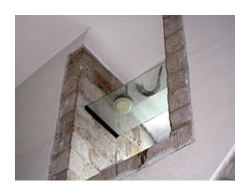
At Old Jerusalem's Rabban Yochanan ben Zakai Synagogue, a flask of oil and a shofar await the Mashiach.[14]

While the shofar is best known nowadays for its use on Rosh Hashana, it also has a number of other ritual uses. It is blown each morning during the month of Elul, 151 and to mark the end of the day of fasting on Yom Kippur, once the services have been completed in the evening. In Talmudic times it was also blown to introduce Shabbat. At the inception of the diaspora, during the short-lived ban on playing musical instruments, the shofar was enhanced in its use, as a sign of mourning for the destruction of the temple. The declaration of the ban's source was in fact set to music itself as the lamentation "Al Naharoth Bavel" within a few centuries of the ban. (A full orchestra played in the temple. The ban was so that this would not be taken for granted, hence the wording of the ban, "if I forget thee O Jerusalem, over my chiefest joy...".) The shofar is generally no longer used for secular purposes (see a notable exception in a section further down). [18]