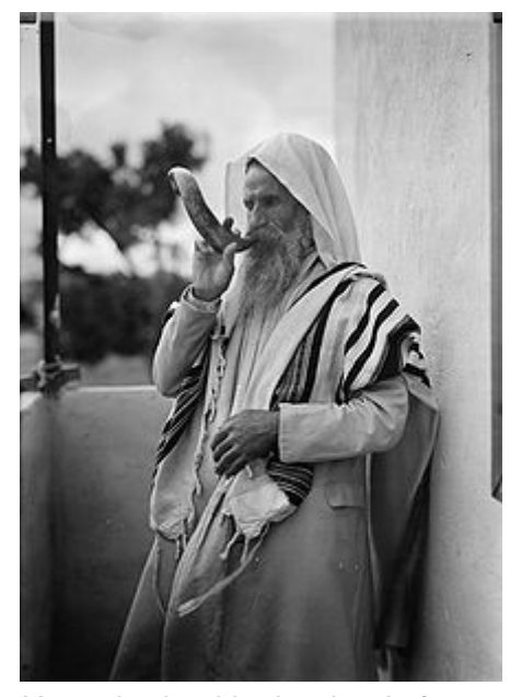
Yemenite Jew blowing the shofar, late 1930s