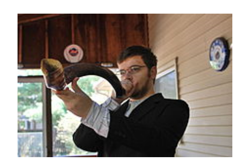
Blowing the shofar