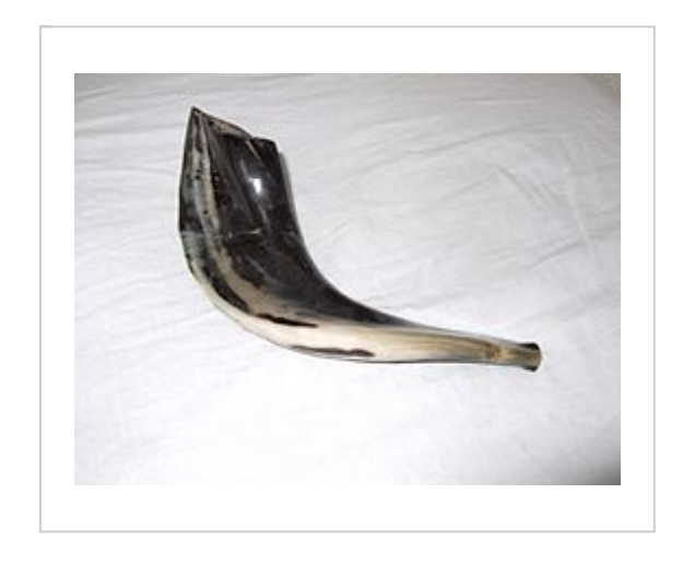
A small shofar made from a ram's horn.