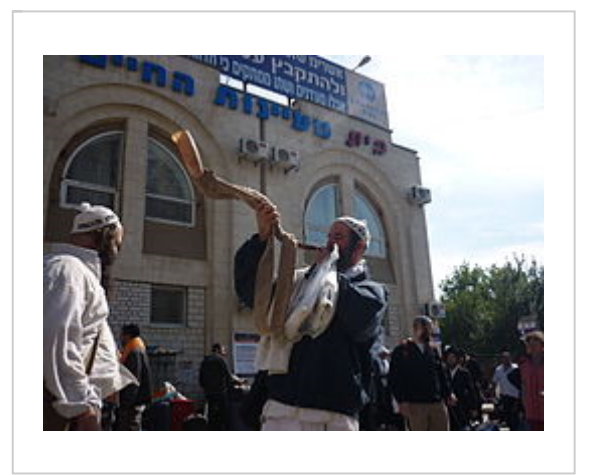
A Jewish <u>Haredi</u> man blowing Shofar, 2012