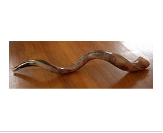
A small shofar made from a <u>ram</u>'s A shofar made from the horn of a horn. Greater kudu.