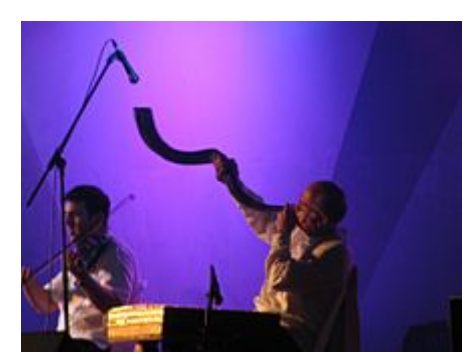
A musician blows the shofar during a performance by Shlomo Bar, 2009.

In pop music, the shofar is used by the Israeli Oriental metal band Salem in their adaptation of "AI Taster" (Psalm 27). The late trumpeter Lester Bowie played a shofar with the Art Ensemble of Chicago. In the film version of the musical Godspell, the first act opens with cast member David Haskell blowing the shofar. In his performances, Israeli composer and singer Shlomo Gronich uses the shofar to produce a very wide range of notes. [34] Since 1988 Rome-based American composer Alvin Curran's project Shofar features the shofar as a virtuoso solo instrument and in combination with sets of natural and electronic sounds. Madonna used a shofar played by Yitzhak Sinwani on the Confessions Tour and the album Confessions on a Dance Floor for the song "Isaac", based on Im Nin'alu. In 2003, The Howard Stern Show featured a contest called "Blow the Shofar", which asked callers to correctly identify popular songs played on the shofar.