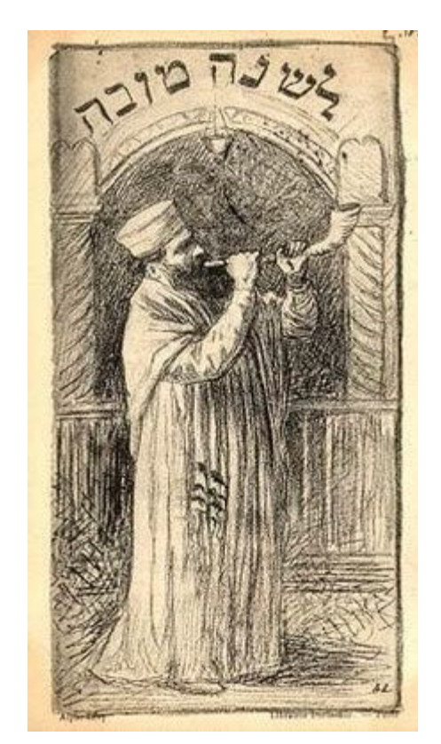
Shofar (by Alphonse Lévy Caption says: "To a good year"

were inserted into the temple orchestra by \underline{\text{David}}.^{\underline{[9]}} Note that the "trumpets" described in Numbers 10 are a different instrument, described by the Hebrew word for 'trumpet' ( \underline{\text{Hebrew}} : תופר, \underline{\text{romanized}}: \underline{h}a\underline{s}o\underline{s}rah ), not \underline{shofar} (Hebrew: שופר). \underline{[10]}