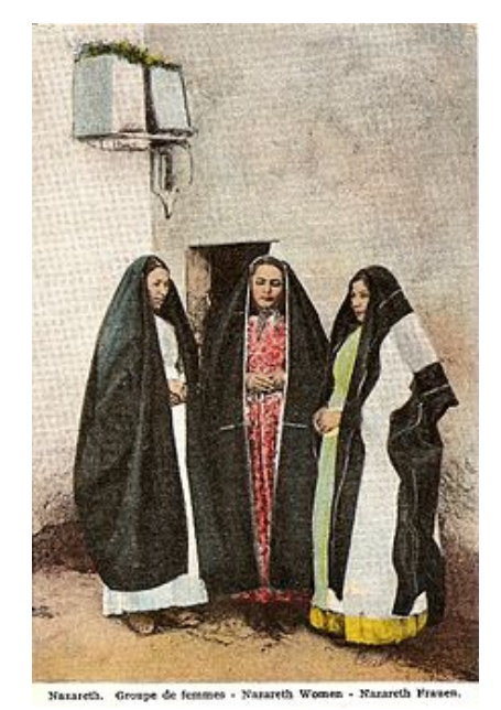
Old postcard of Nazareth women based on photo by Félix Bonfils

In 1946, Nazareth had a population of 15,540, of whom roughly 60% were Christians and 40% were Muslims. The 1948 War led to an exodus of Palestinians and many expelled or fleeing Muslims from villages in the Galilee and the Haifa area found refuge in Nazareth. At one point, some 20,000 mostly Muslim internally displaced persons were present in the city. Following the war's conclusion, the internally displaced persons of Shefa-