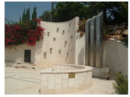
Monument to Arab Israeli casualties in the October 2000 events, Nazareth

As the political center of Israel's Arab citizens, Nazareth is the scene of annual rallies held by the community including Land Day since March 1975 and May Day. There are also frequent demonstrations in support of the Palestinian cause. During the First Intifada (1987–1993), May Day marchers vocally supported the Palestinian uprising. On 22 December 1987, riots broke out during a strike held in solidarity with the Intifada. On 24 January 1988, a mass demonstration attracted between 20,000–50,000 participants from Nazareth and other Arab towns. On 13 May, during a football match in Nahariya, a riot broke out between Arab and Jewish fans, resulting in a Jewish man being stabbed and 54 people, mostly Arabs, being arrested. A rally in Nazareth on 19 May followed, in which thousands of Arabs protested against "racist attacks" against the Arab fans and discriminatory policies against Arabs in general.