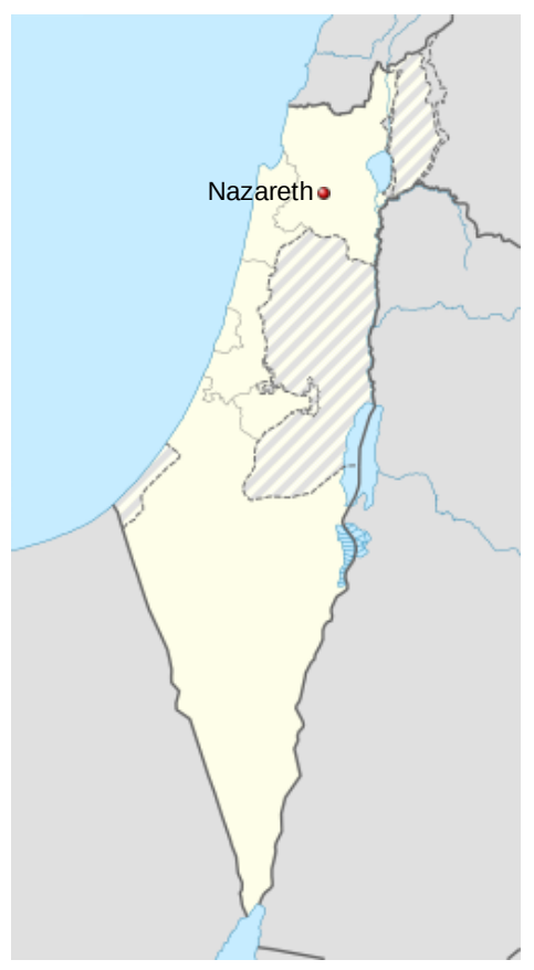
Location of Nazareth in Israel Coordinates: 32°42′07″N 35°18′12″E