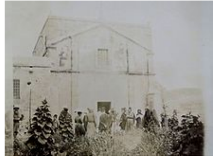
Church in Nazareth on the supposed site of Joseph's workshop, 1891