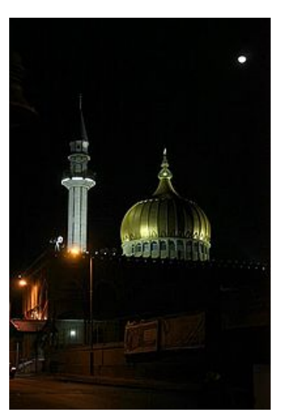
Makam al-Nabi Sain Mosque of Nazareth