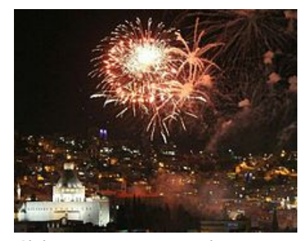
Christmas Eve In Nazareth