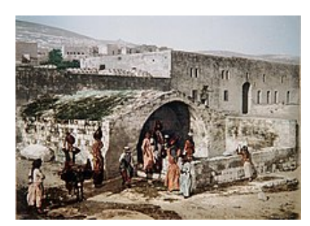
\frac{\text{Well of St. Mary, Nazareth, by }\underline{\text{Felix}}}{\text{Bonfils, ca 1880}}