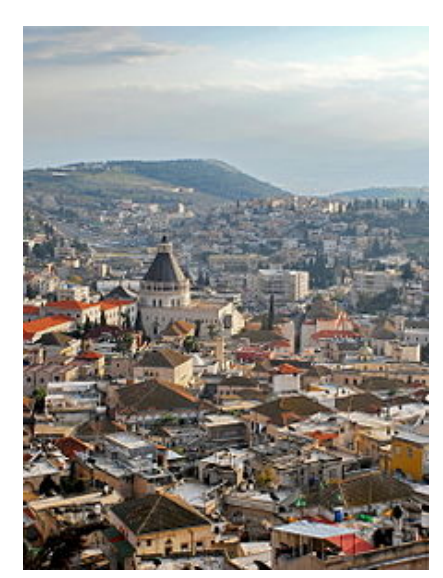
View of modern Nazareth