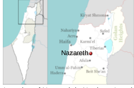
Location of Nazareth in Northern Israel