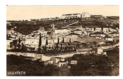
Nazareth, postcard by <u>de:Fadil</u> Saba, ca 1925