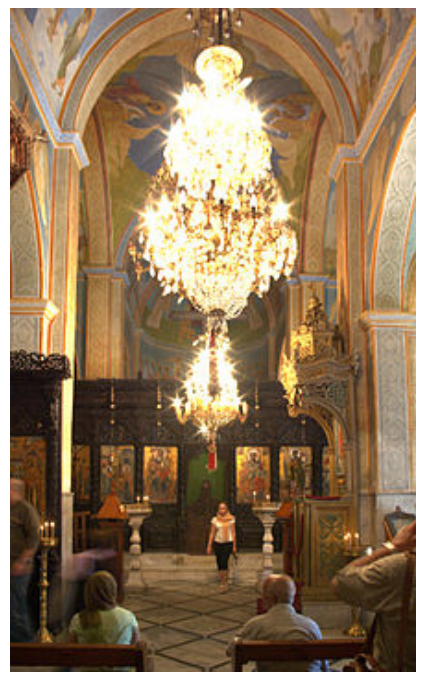
Greek Orthodox Church of the Annunciation