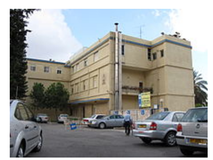
Italian Nazareth Hospital

■ <u>Baguio</u>, Philippines<sup>[140]</sup>