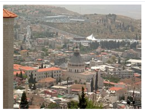
View of Nazareth, with the <u>Basilica of</u> the Annunciation at the center