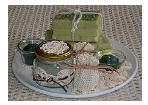
Handmade Mother's Day gifts