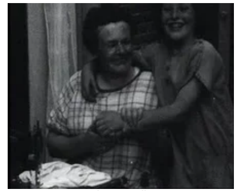
Play media Mother's Day in the Netherlands in 1925

In some cases, countries already had existing celebrations honoring motherhood, and their celebrations then adopted several external characteristics from the US holiday, such as giving carnations and other presents to one's mother.