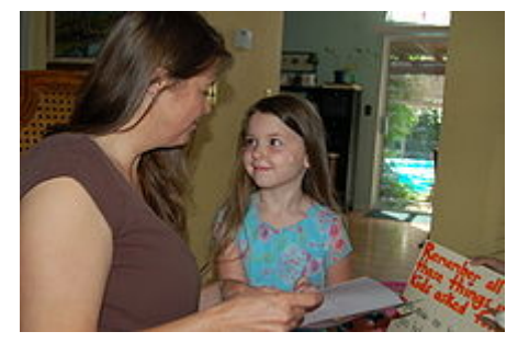
Mother and daughter and Mother's Day card