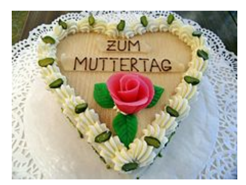
Mother's Day cake in Germany

In the 1920s, <u>Germany</u> had the lowest birthrate in Europe, and the declining trend was continuing. This was attributed to women's participation in the labor market. At the same time, influential groups in society (politicians of left and right, churchwomen, and feminists) believed that mothers should be honored but could not agree on how to do so. However, all groups strongly agreed on the promotion of the values of motherhood. In 1923, this resulted in the unanimous adoption of Muttertag , the Mother's Day holiday as imported from America<sup>[93]</sup> and Norway. The head of the Association of German Florists cited "the inner conflict of our <u>Volk</u> and the loosening of the family" as his reason for introducing the