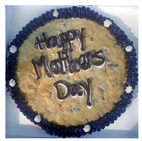
Mother's Day cookie cake

Mother's Day is becoming more popular in <u>China</u>. Carnations are a very popular Mother's Day gift and the most sold flowers in relation to the day. [79] In 1997 Mother's Day was set as the day to help poor mothers and to remind people of the poor mothers in