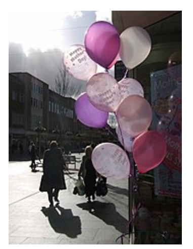
<u>Balloons</u> outside, in the week before Mother's Day 2008

mothers but for organizing pacifist mothers against war. In the 1880s and 1890s there were several further attempts to establish an American "Mother's Day", but these did not succeed beyond the local level. [173]