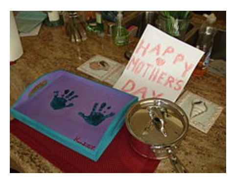
Mother's Day gift in 2007