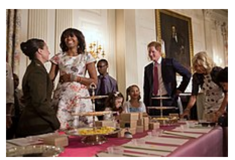
Prince Harry, Michelle Obama and Jill Biden helping children create Mother's Day cards at the White House, 9 May 2013

The United States celebrates Mother's Day on the second Sunday in May. In 1872 Julia Ward Howe called for women to join in support of disarmament and asked for 2 June 1872, to be established